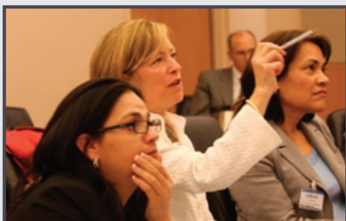
Participants at IBM's Summit

"Out Before the Game Begins: Hispanic Leaders Talk About What's Needed to Bring More Hispanic Youngsters Into Science, Technology and Math Professions" is based on in-depth interviews with 19 key leaders from vastly different fields and backgrounds.