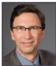
Frank Sesno CNN correspondent